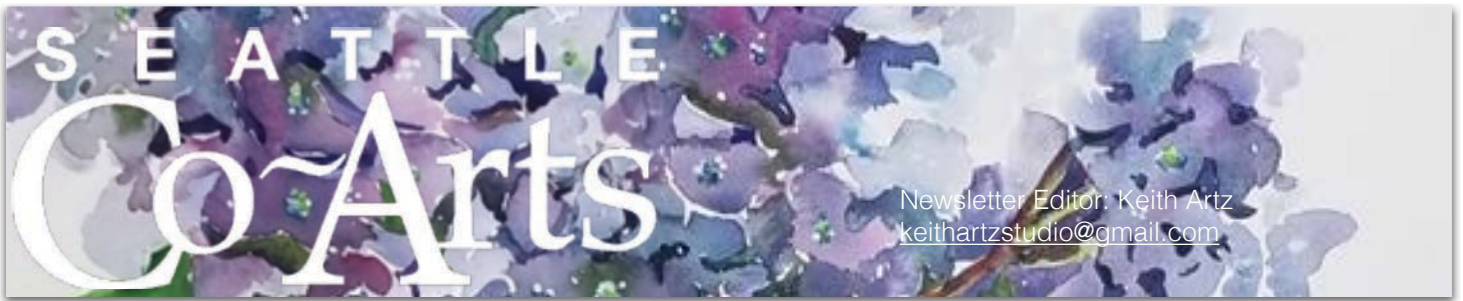
Masthead art (detail) by Kathryn Flanagan