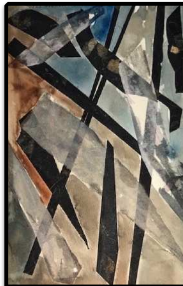
SECOND PLACE: Bob Lauderbach "Spoorweg 1940" Watercolor/Collage