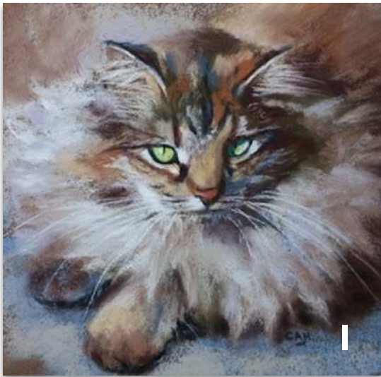
Maine Coon. Pastel