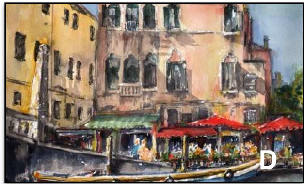
Venice Dream. Watercolor