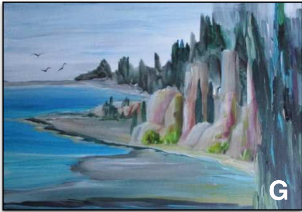
The Towers. Acrylic