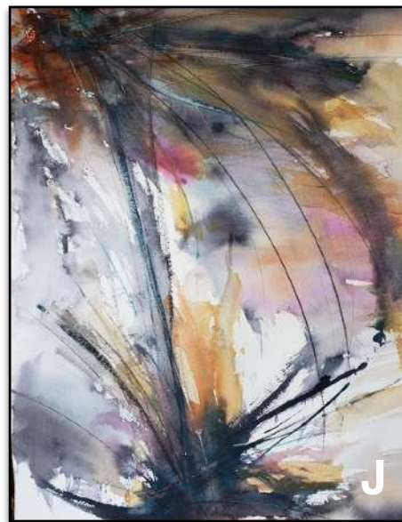
Errant Voyage. Watercolor