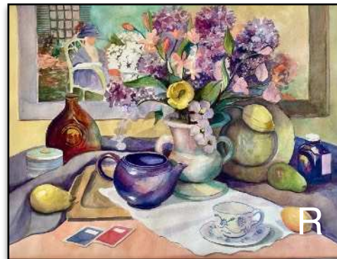
Tea Time Watercolor