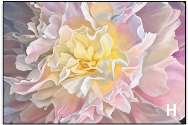
Peony Parfait. Oil