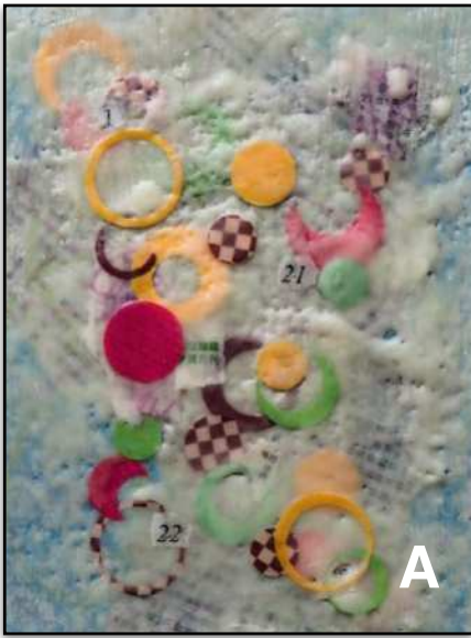
Circular Joy . Mixed Media / Encaustic