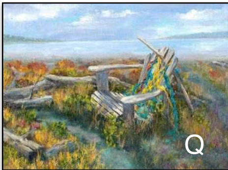
Beach Altar. Oil