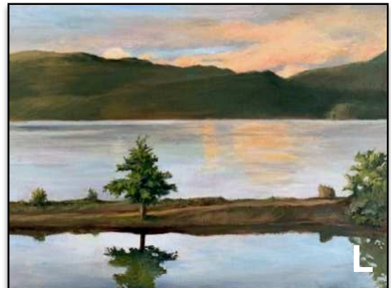
At the End of the Day. Watercolor