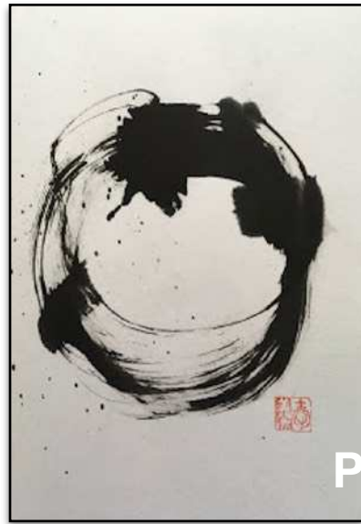
COVID Enzo, Not Forever. Sumi-e