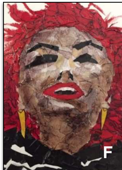
Laughing Feels so Good. Masking tape, Watercolor, Wax Shoe Polish on Canvas