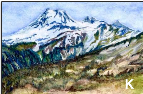
Mount Baker Watercolor