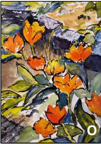
Fred's Flowers Watercolor & Sumi-e