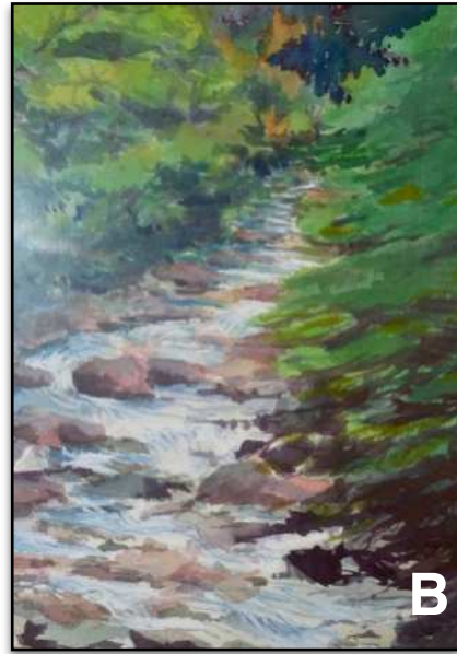
From the Bridge Route 2 Watercolor