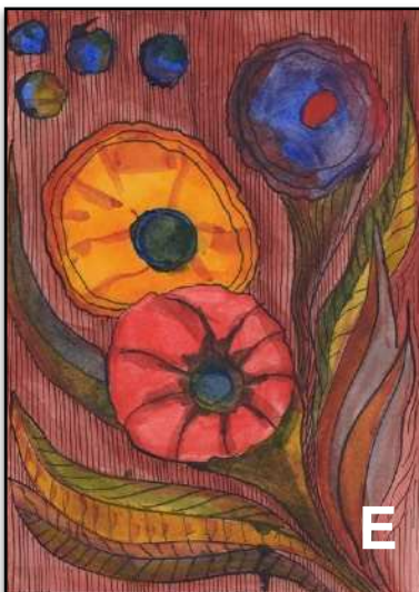
Padula Flowers Watercolor & Pen