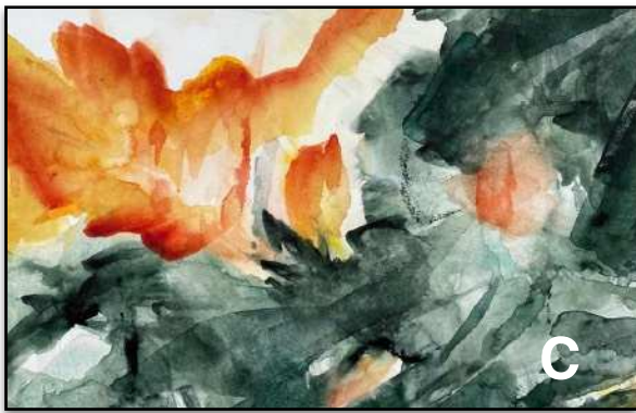
The Unfolding Watercolor