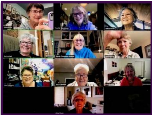
Attendees in September!