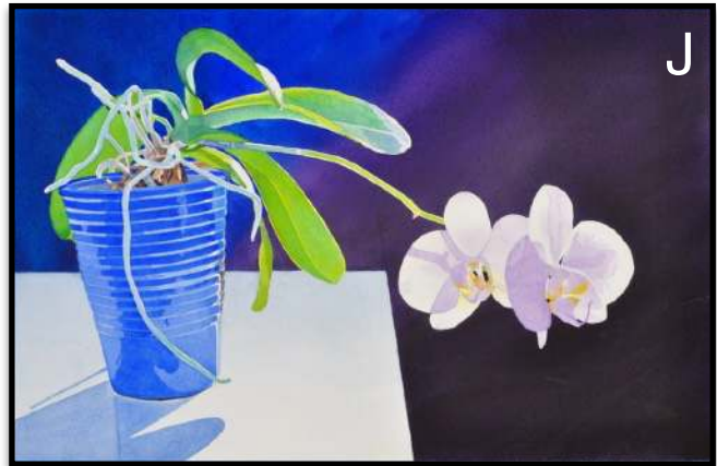
"TWO FOR THE ROAD" Watercolor