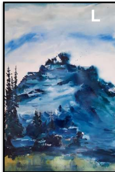
"MELTING GLACIERS" Watercolor