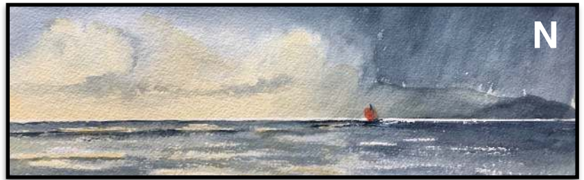
"BEATING THE STORM" Watercolor