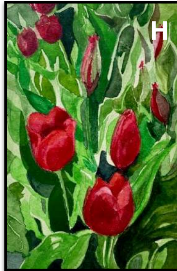
"THE END OF THE ROW" Watercolor