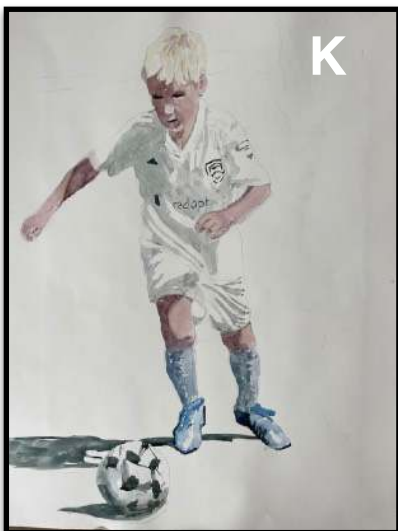
"KICKIN' IT" Watercolor