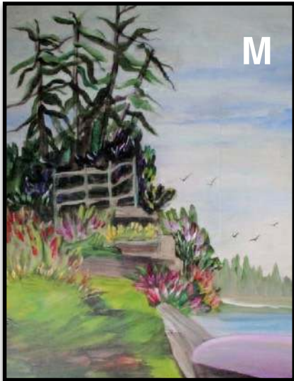
"FUNKY SHORE" Acrylic