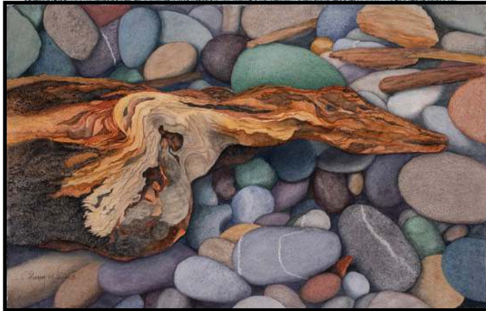
First Place: "Shore Bird". Watercolor Sherry Willis