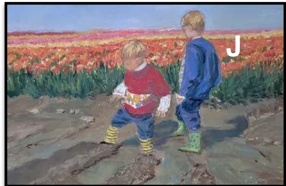
Mud Wins. Soft Pastel