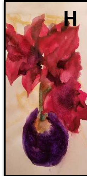
Poinsettia Planted in an Onion Watercolor