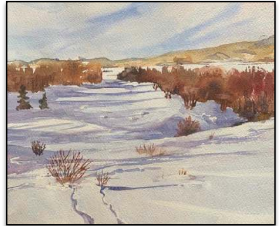
Second Place: "Our Pleasant Valley" Watercolor. Sally Rawlings