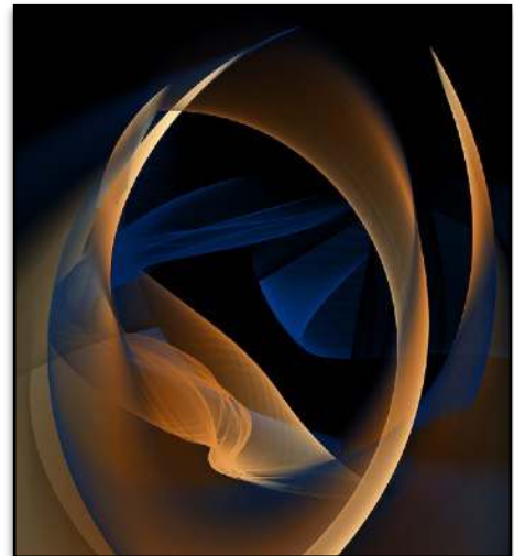
Third Place: "Twin Flames". Digital Art Jyl Blackwell

Congratulations to you and thanks to all for your POM contributions!