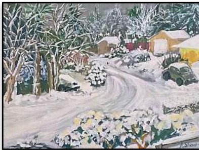
First Snow 2022