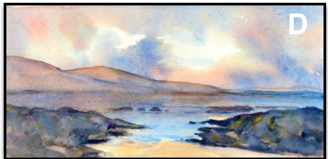
At the Edge of Night. Watercolor