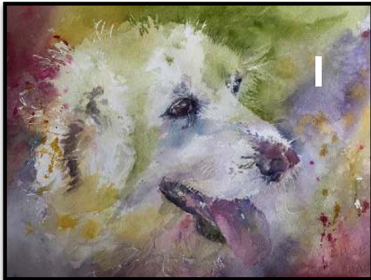
Best Friend. Watercolor