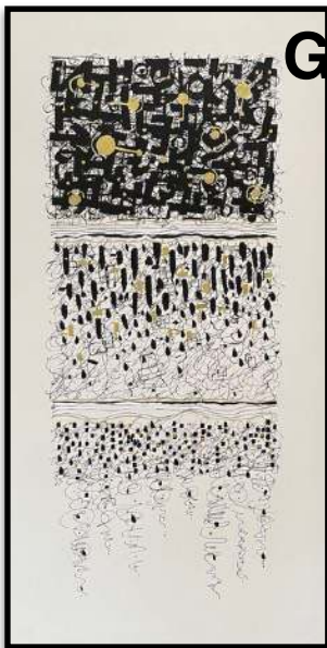
Who Will Stop the Rain? Mixed Media