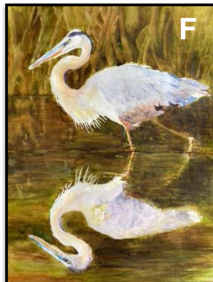
Great Blue Heron. Watercolor