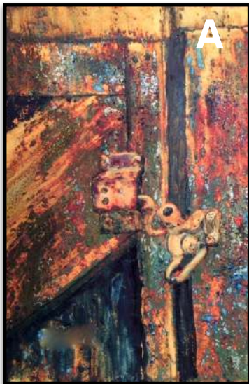
Gated Community. Watercolor