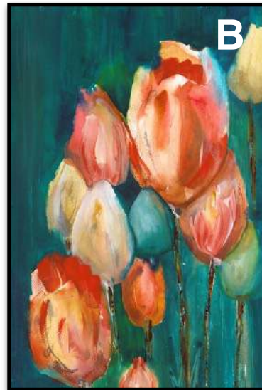
Tulips Just For You. Watercolor