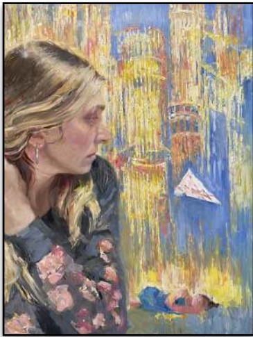
Where Are You Dream?

Before the pandemic, I participated in multiple live model sessions every week.