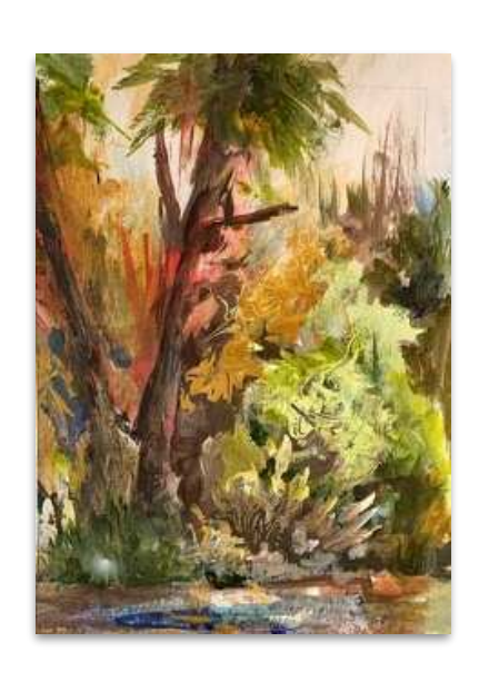
Third Place Elaine Cohn "Out and About" Acrylic