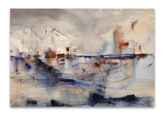
First Place Sandra Kahler "Harbor Island Colors" Watercolor