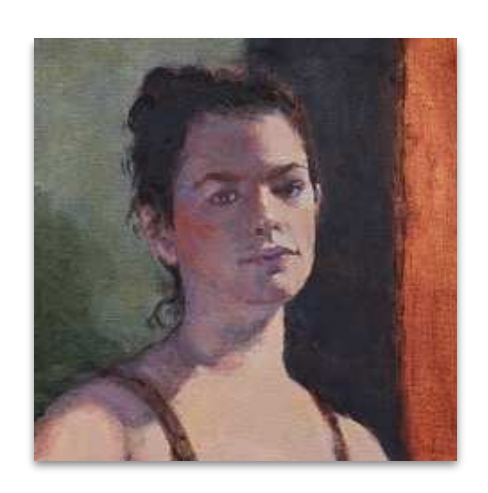
Second Place Steve Momii "Untitled Portrait" Oil