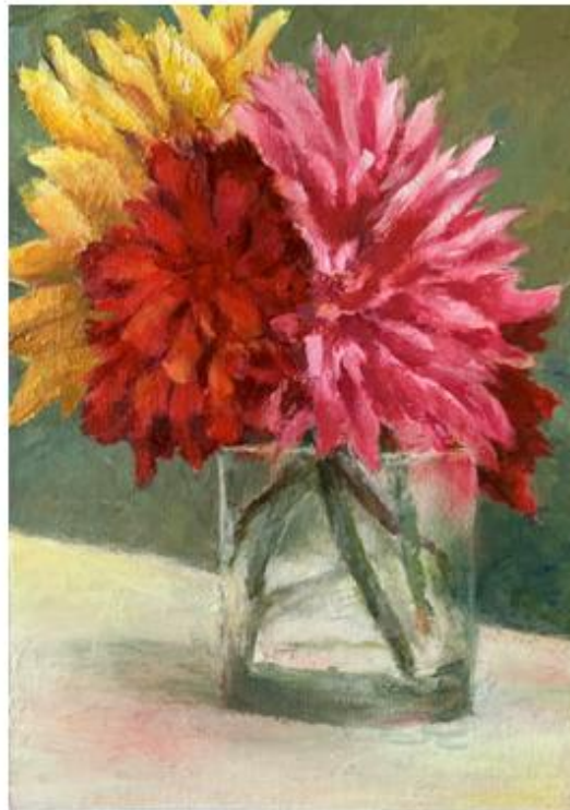
K. Dahlias in Glass - Oil