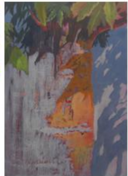
F. Red Twig II-Acrylic