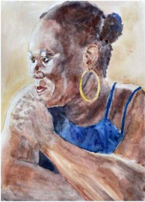
G. Power - Watercolor