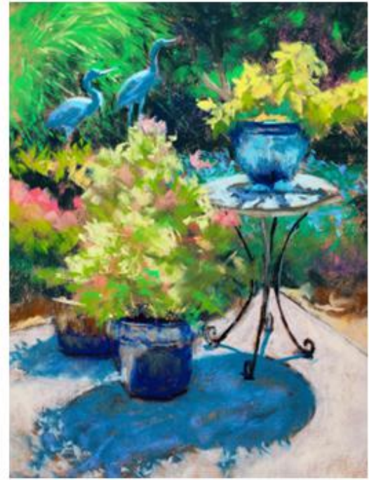
I. Garden Quartet-Pastel