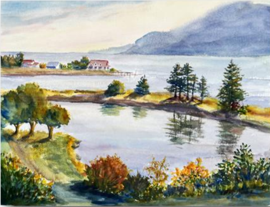
Samish Island Campground Lake and Strait - Painting by Betsy McPhaden

For nearly five days Seattle Co-Arts members attending this year's Fall Paintout found peace and creativity wrapped up with a bow at the Samish Island Campground and Retreat located just west of Edison, Washington and 20 minutes from Anacortes. The days were filled with painting, eating, and conversation.