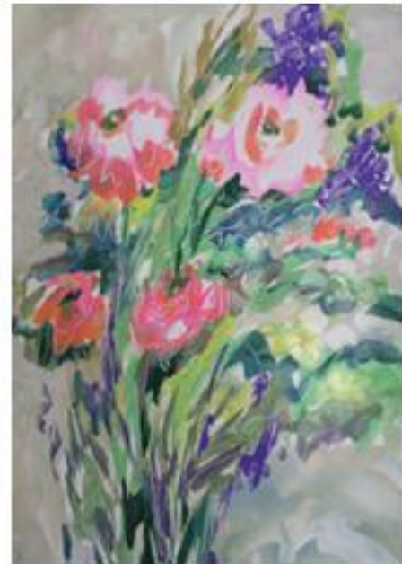
C. Flowers on Top of Spots -Acrylic on Wallpaper