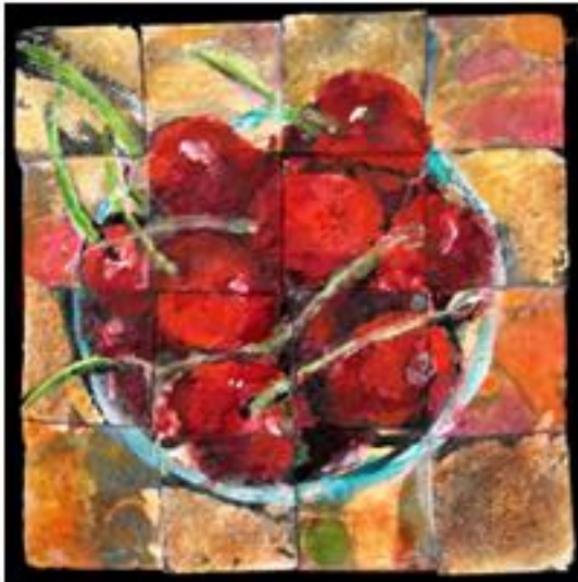
A. Life-Layered Water Media Collage