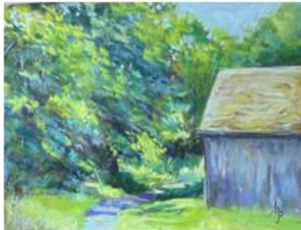
E. Summer Morning at Bloedel- Pastel