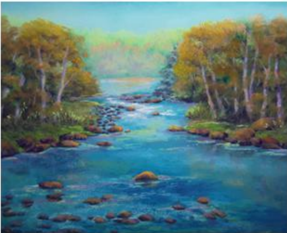
O. Lush Sol Duc River - Pastel