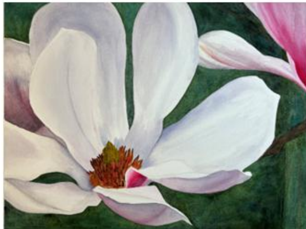
P. L Magnolia 1-Watercolor

To vote for your 3 favorite entries, go to: