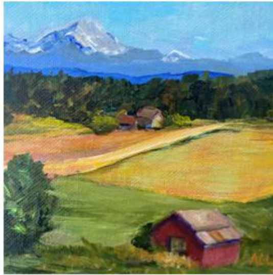
H. Sunnyside Vista - Acrylic