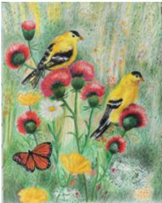
D. Goldfinch Garden-Colored Pencil