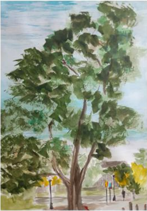
M. Cal Anderson Park- Watercolor