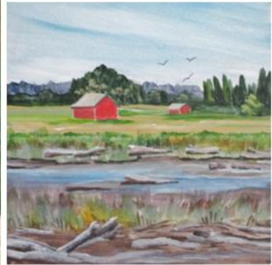
L. Fir Island 3 - Acrylic