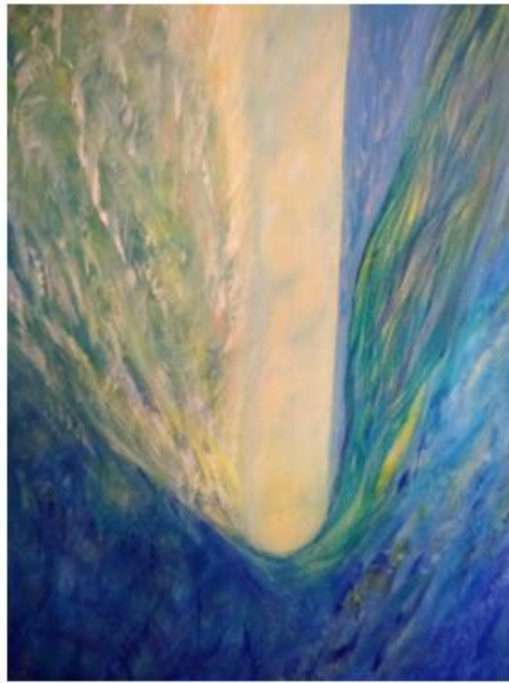
N. Take the Plunge-Acrylic