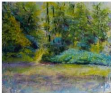
J.The Path To The Point_Watercolor-Pastel.jpg