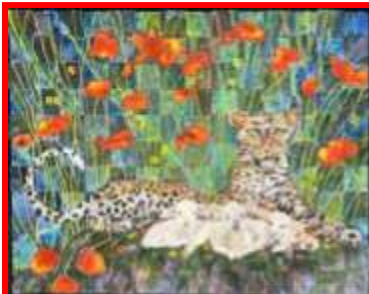
Lynin' Down With the Leopard , 22x28, watermedia collage

Members' show at Women Painters of Washington Gallery , 10-11-22 through 1-6-23 Columbia Center Tower 701 Fifth Avenue, Suite 310, Seattle, Washington 98104 (206) 624-0543