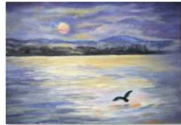
F.Bay View Sunset_Acrylic 3.jpg