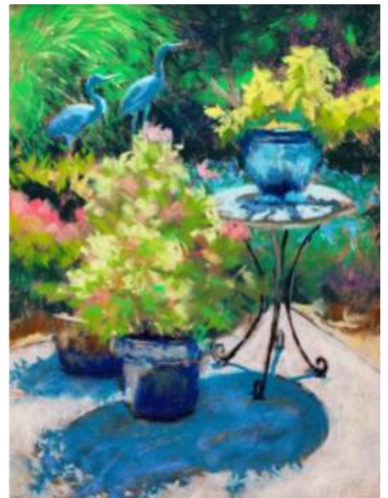
Third Place Cheryl Hufnagel Garden Quartet Pastel