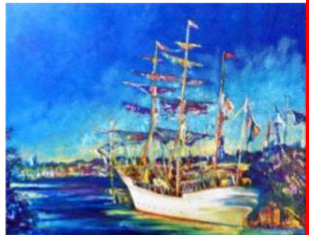
Departure, 30x40, oil

Edmonds Art Walk October 2022 Solo show at Edmonds Vision Center 201 Fifth Avenue South, Edmonds, Washington 98020 425-771-7772