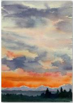
A.Sunrise From Above_Watercolor.jpeg