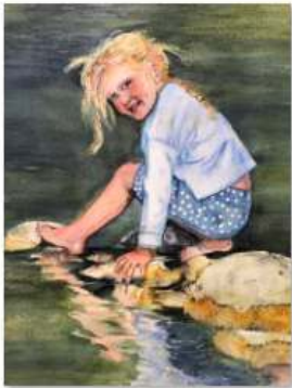
D.By The River_Watercolor.jpeg