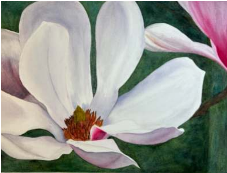
Second Place Sherry Willis Magnolia 1 Watercolor