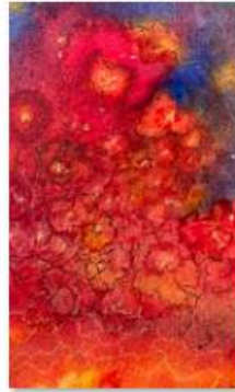
B.Abundant Life, Watercolor and Ink.jpg