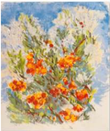
J. The Strawberry Tree