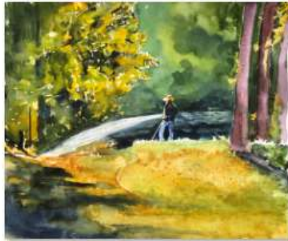
B. Watering by the River