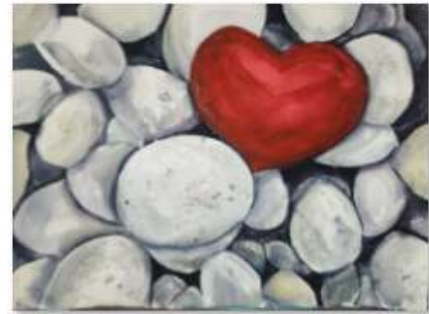
C. February My Heart Belongs to You