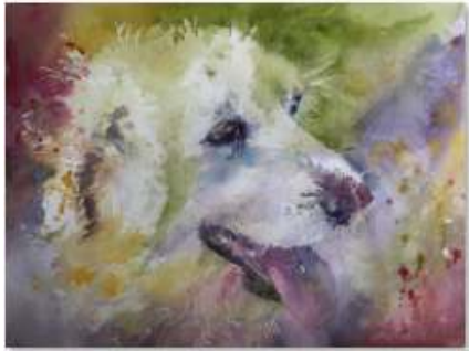
A. Best Friends