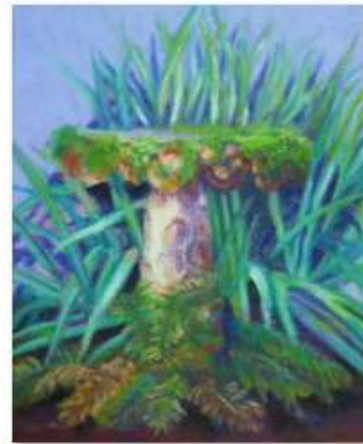
I. Vintage Birdbath