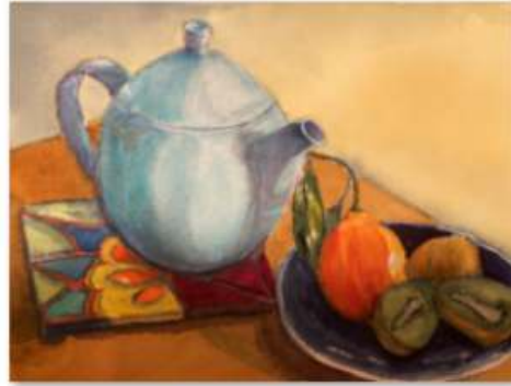
N. Good Morning