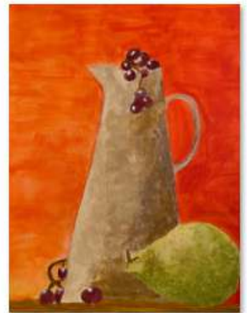
L. Still Life With Pear