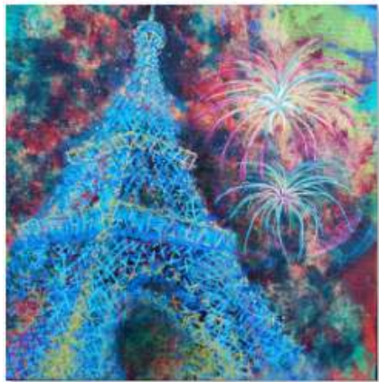
D. Bastille Day