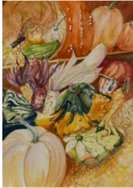
Second Place Plenty of Pumpkins Lauriel Sandstrom