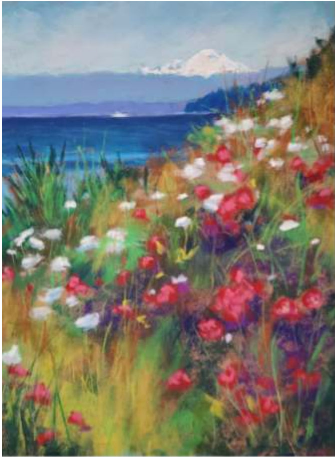
First Place Looking North Cheryl Hufnagel