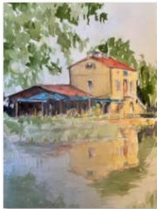
E. Garonne Lock House