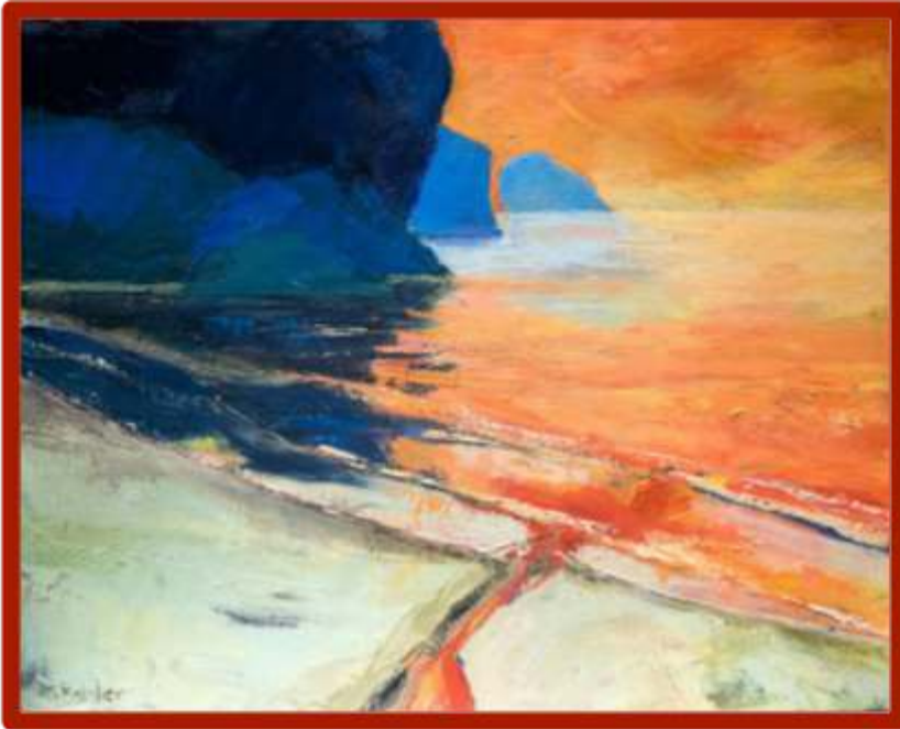
Ocean Thoughts on Orange and Blue by Sandra Kahler

The price, including 3 daily meals, for the E cabin is $575 per person. The rustic cabin is $540 per person. Registration is open now (watch your email for the registration form) with a deposit of $100 paid on the SCA website by credit card, or by check sent to Sabrina Poon at 19326 5th Ave. NE Shoreline WA 98155.