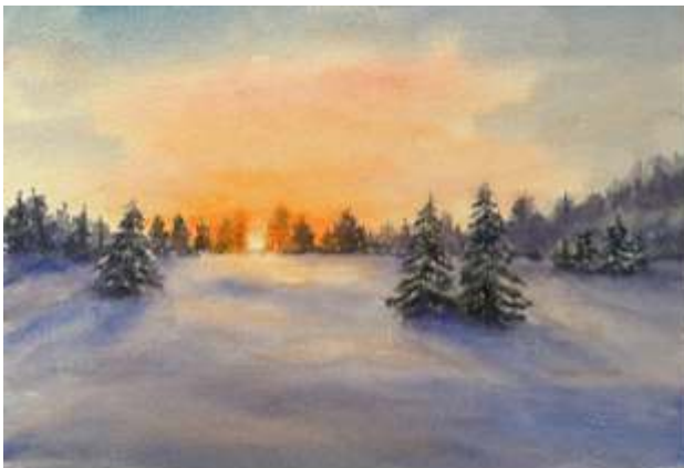
Second Place Betsy McPhaden Dawn 1/1/2023 Watercolor