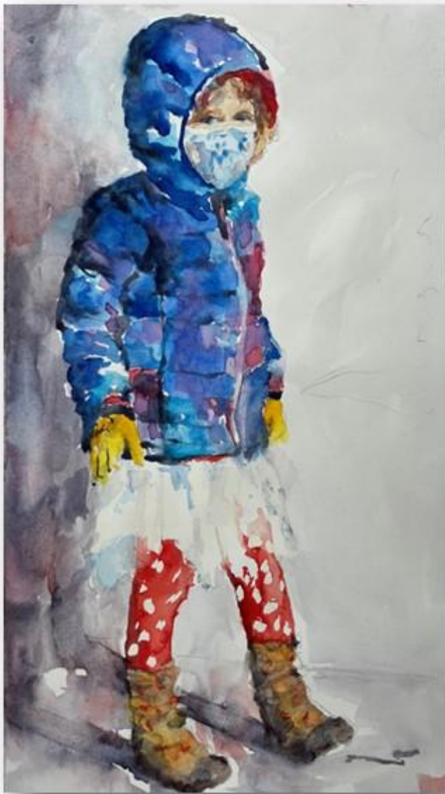
First Place - Susan Killen Safety Check Watercolor